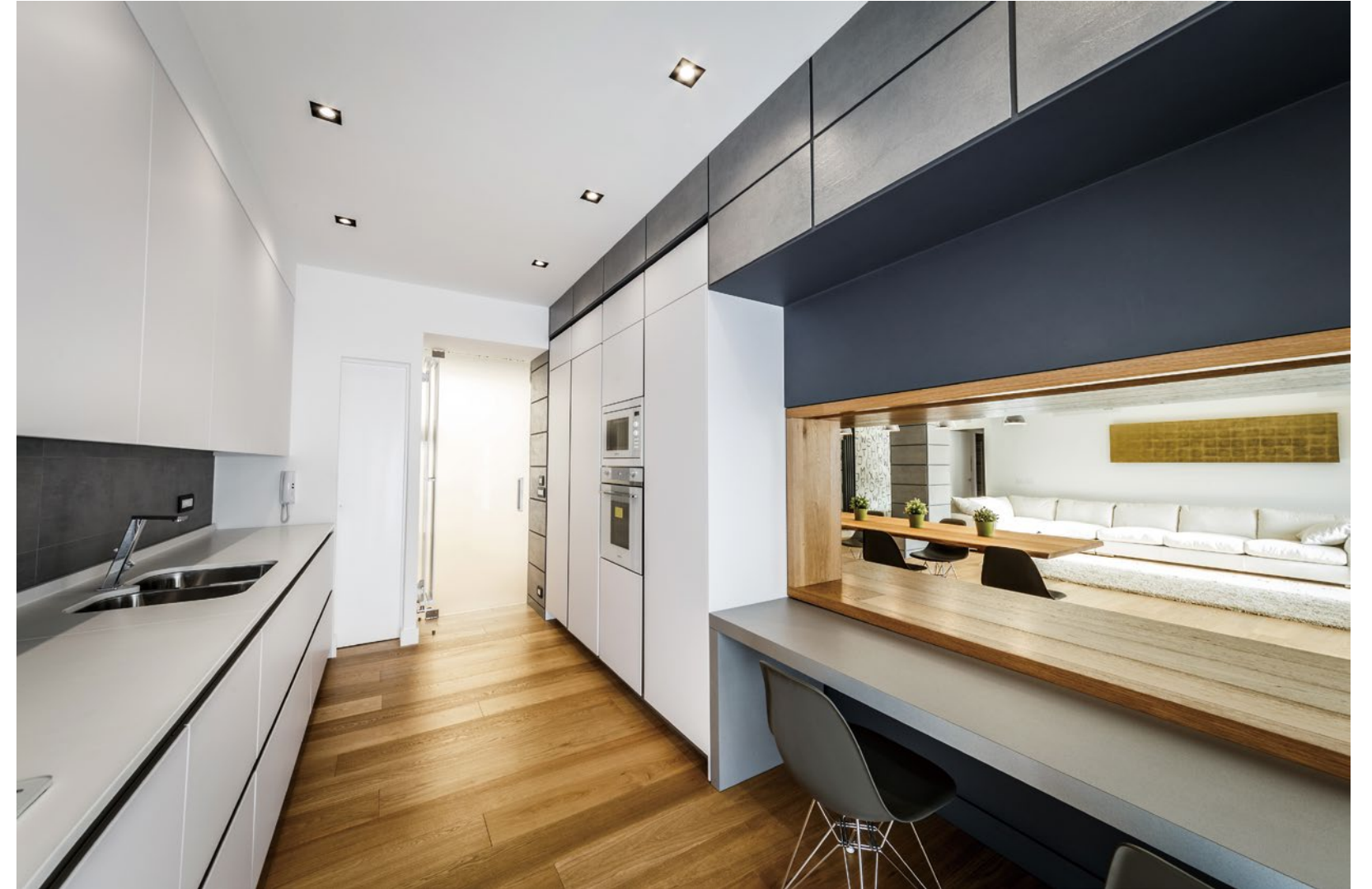
Window in kitchen