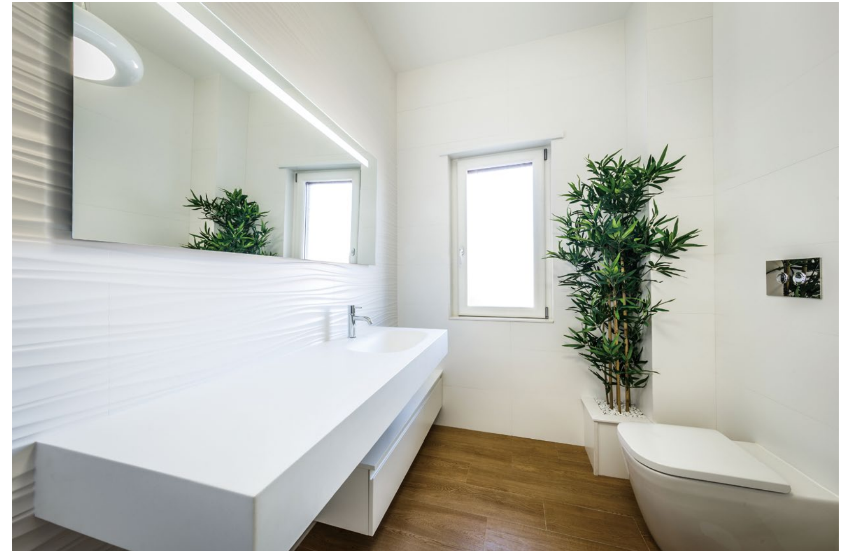
Above: Bathroom Left: Hallway near living room