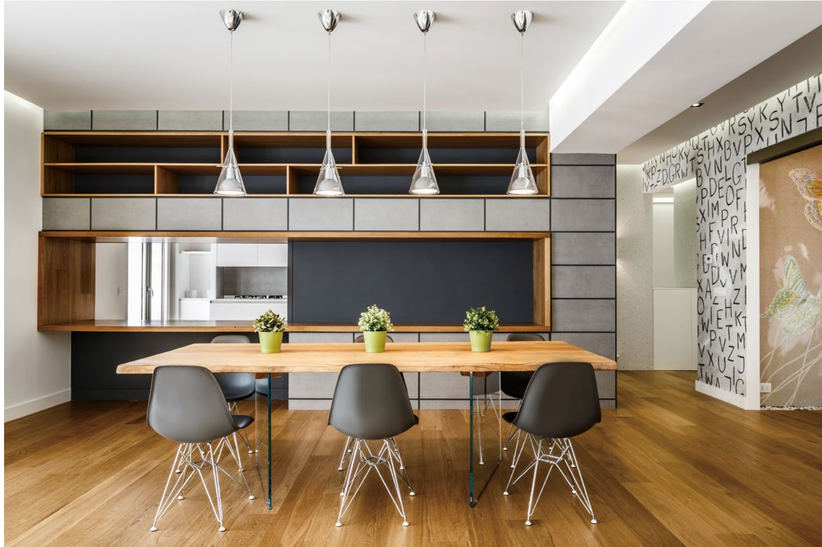
View of monolithic block