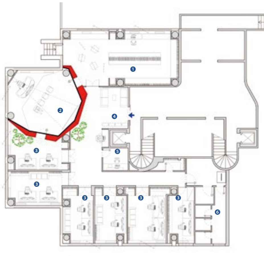
⌵ Floor plan