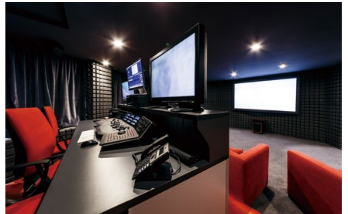
10 View of interior design office 11-12 The important role of graphic effects 13 The minimalist bathrooms 14-16 The most powerful and innovative system of color correction inside the conceptual meteorite